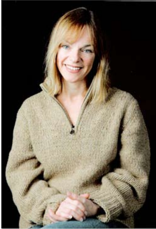
Playwright Amy Freed.