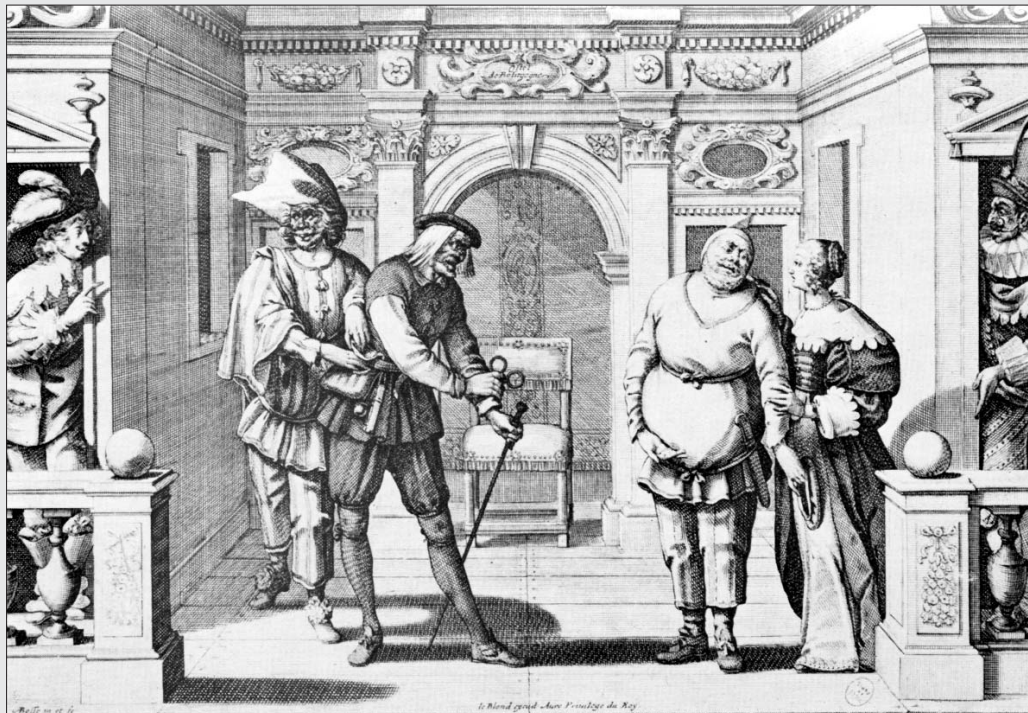
The Royal Players of the Hôtel de Bourgogne.

he denounced Molière to the King, accusing the great playwright of having married his own daughter, a rumor that plagued Molière throughout his later years. The King did nothing directly about