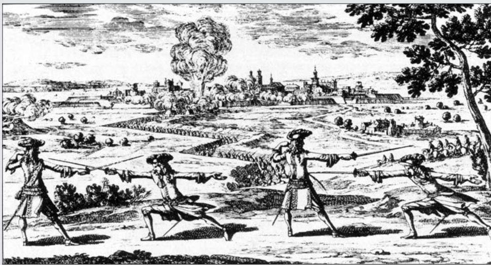
Fencing positions from a French seventeenth-century handbook.

from The Duel, Its Rise and Fall in Early Modern France by François Billacois (New Haven: Yale University Press, 1990).