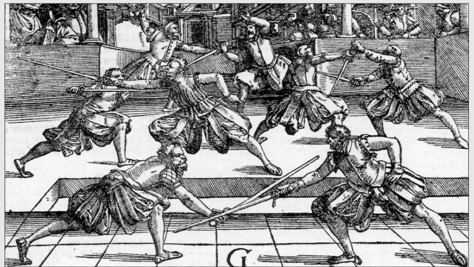
A German training school, from a sixteenth-century handbook on fencing.

According to supernatural arguments, the French aptitude, and indeed vocation, for single combat was beyond all rational explanation, except perhaps for that of as-