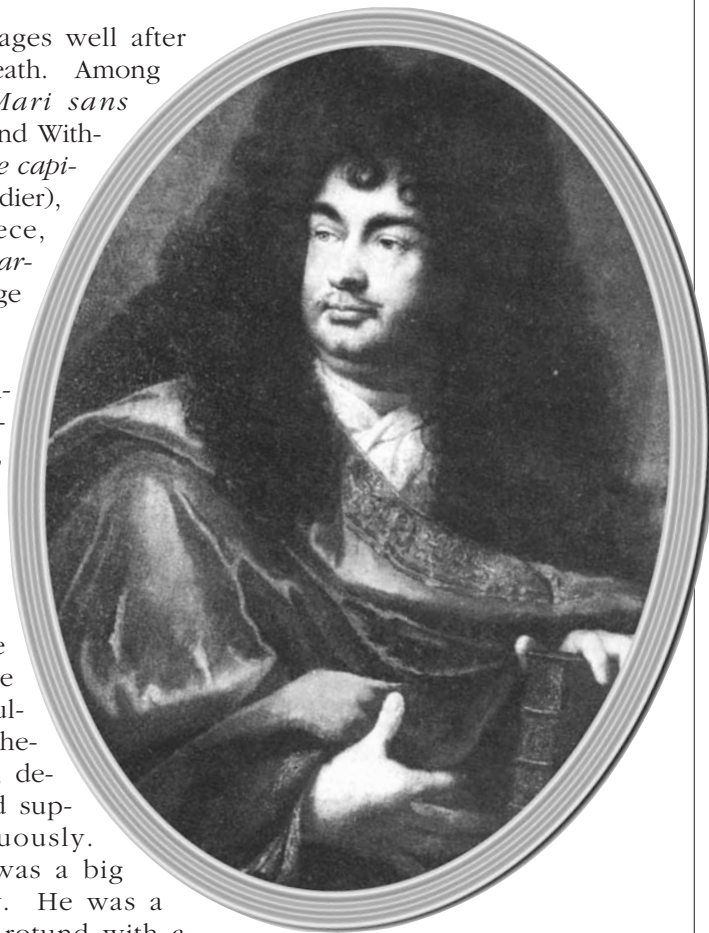
Zacharie Jacob de Montfleury (1600-1667), father of the playwright.

Montfleury came from a prestigious theatre family. His father, Zacharie Jacob, also known as Montfleury, was a sometime-playwright and renowned actor, one of the great stage performers in a culture that took its theatre very seriously, debated it hotly, and supported it assiduously. Montfleury père was a big presence, literally. He was a mammoth figure, rotund with a powerful, booming voice and given to