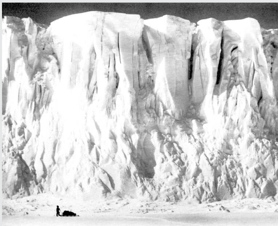
Edge of the ice shelf.