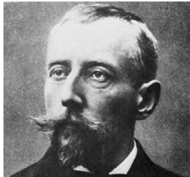
ROALD AMUNDSEN Leader of the Norwegian Party