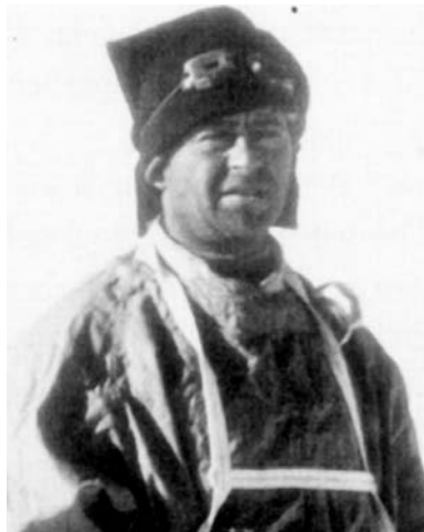
ROBERT FALCON SCOTT Leader of the English Party