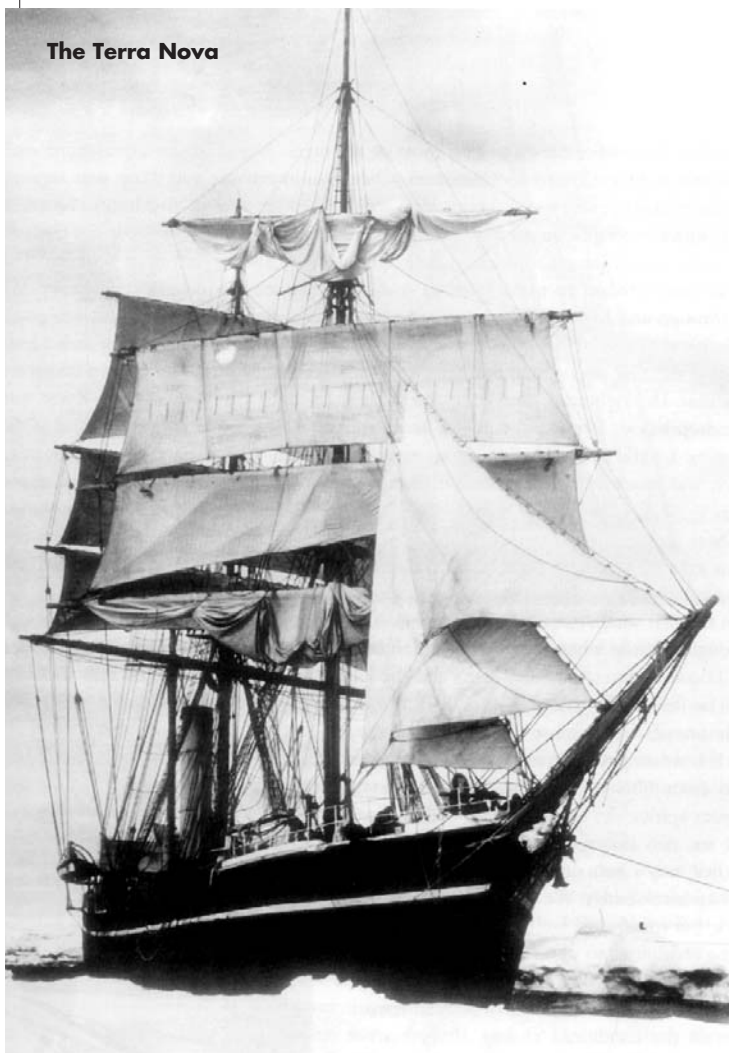
The Terra Nova

Transvaal – a province of South Africa 1910-1994, founded by Boers in the mid-1850s as South African Republic, annexed by Great Britain in 1877 and renamed Crown Colony of Transvaal (literally “beyond the Vaal River” as seen from the Cape of Good Hope)