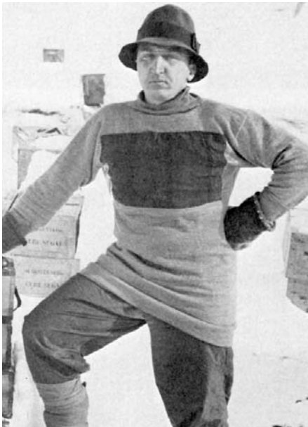
HENRY "BIRDIE" BOWERS British Naval Lieutenant