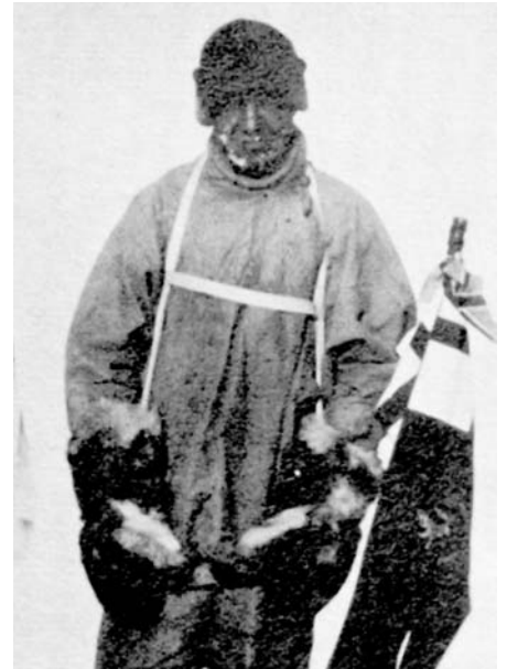
LAWRENCE "TITUS" OATES British Cavalry Officer