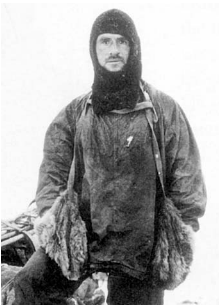
EDGAR "TAFFY" EVANS British Naval Petty Officer