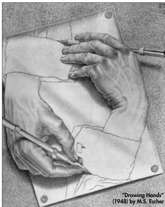
"Drawing Hands" (1948) by M.S. Escher