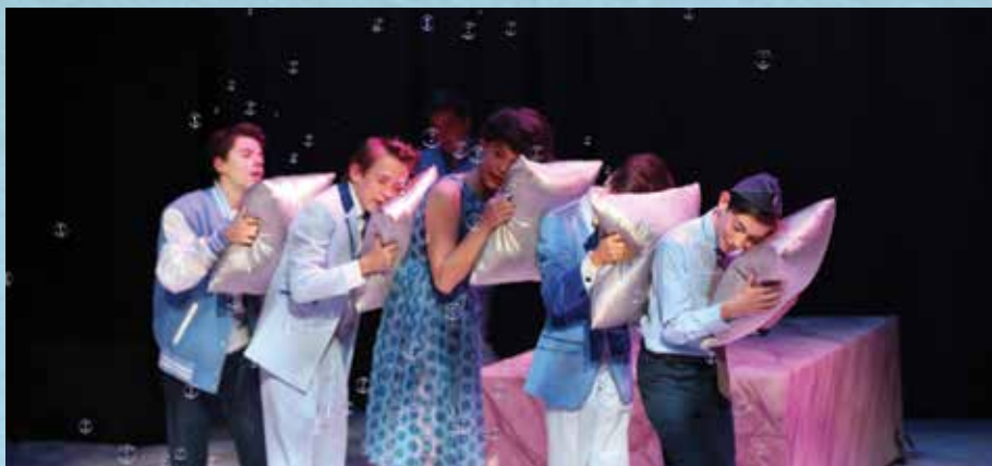
The Junior Players in SCR's Theatre Conservatory production of Gossamer .