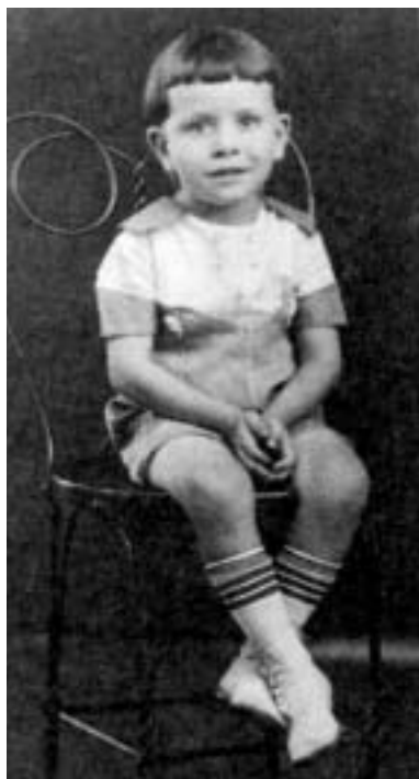
Horton Foote at three and fourteen. The latter taken in front of a house his father sold in order to send him to drama school.