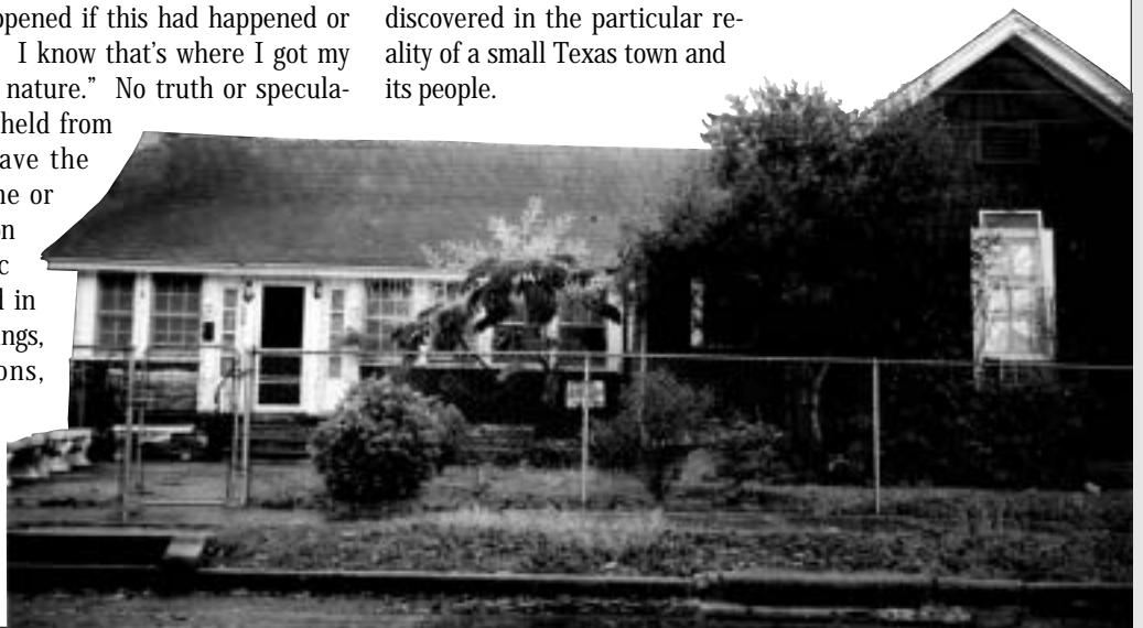
Horton Foote's birthplace

Yet no matter how diverse his writing has become, the source of his creativity has always been Wharton, Texas. Foote was fascinated at an early age by the people around him—living and dead—how they lived and died, loved and lost, prevailed and endured. The dramatic tension between their inner lives and their appearance of decorum and calm made profound impressions on him. Today, his homeplace still inspires his writing. The cotton fields, the pecan trees, the front porch swings, the cemeteries, the dwindling towns—images of his youth—move poignantly through his plays. They testify to the brutality, beauty, and mystery of life, to the universals discovered in the particular reality of a small Texas town and its people.