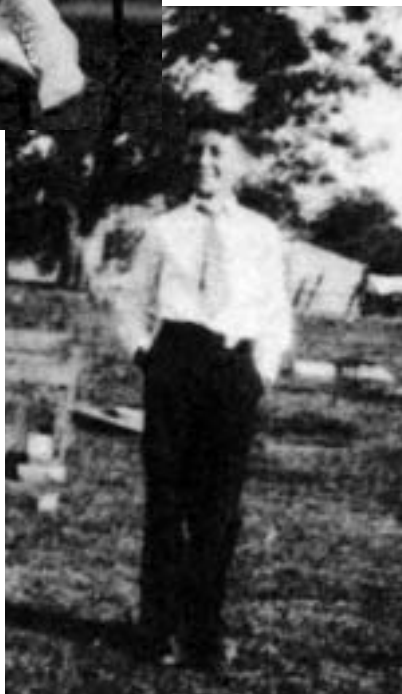
Courtship . These films re-edited for PBS as The Story of a Marriage .