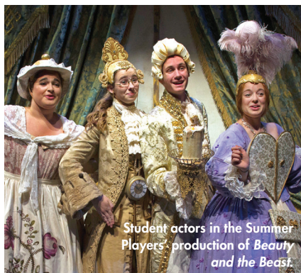
Student actors in the Summer Players' production of Beauty and the Beast .

Ella Enchanted is an adaptation of Cinderella that tries to answer a question: why was Cinderella always so obedient? Author Gail Carson Levine came up with a solution to that problem by inventing the character of Lucinda, a misguided fairy who puts Ella under a curse of obedience. In doing so, she makes the story newly relevant to anyone who lives with rules or choices that they don't always agree with—in other words, all of us.