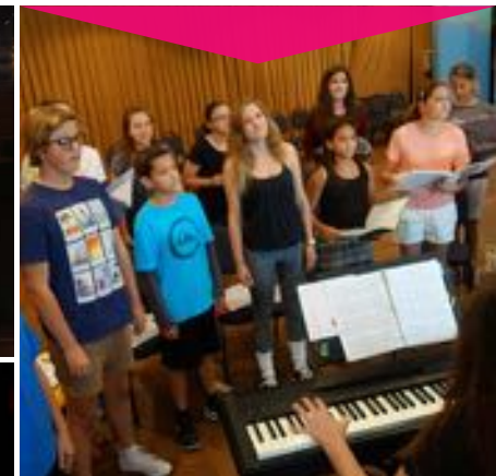
The cast of the 2018 Summer Players production of Seussical