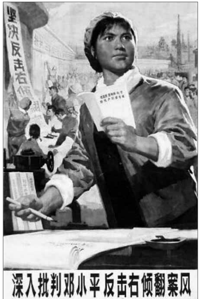
An example of one of the propaganda posters used in Mao's China.

In response to Khrushchev’s speech and the upheaval in Eastern Europe that followed, Mao and the CCP initiated the Hundred Flowers Campaign, which took its name from the line of a famous poem: “Let a hundred flowers bloom, let a hundred schools of thought contend.” The campaign—which, in an effort to distance Mao’s leadership from Stalinism, encouraged the Chinese public to critique the government—began on May 1, 1957. It lasted a mere five weeks, however, because Mao and his party officials had underestimated the public’s grievances. In June, the campaign was abruptly reversed and replaced with an Anti-rightist Campaign that punished many of the dissidents who spoke out during the month of Hundred Flowers. The government’s most vocal critics were fired from their jobs or sent to collective farms or labor camps. The few who were deemed the most dangerous were executed.