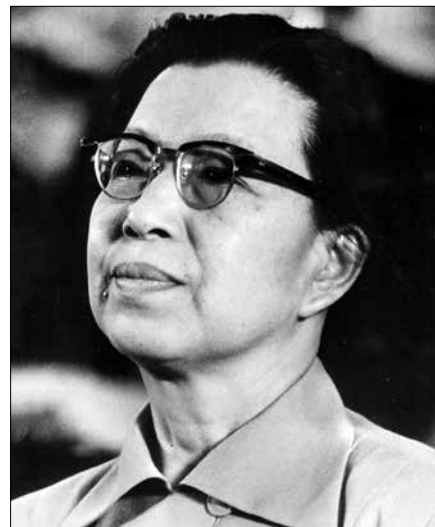
Mao's wife, Jiang Qing, pictured here in 1976, was a harsh critic of Wu Han and would later play an important role in the Cultural Revolution.

For Mao, the disagreement among the ranks provided the perfect opportunity to set his next plan into motion. With Hai Rui , Wu Han had unwittingly opened the door for Mao's Cultural Revolution.