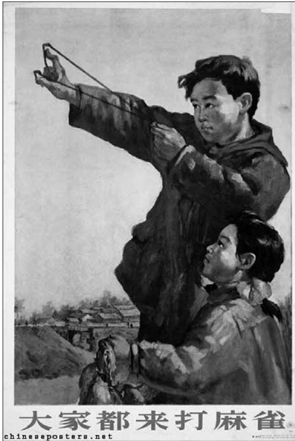
A poster from the Great Sparrow Campaign. During the Great Leap, the CCP encouraged citizens to eradicate the Eurasian tree sparrow, which ate grain and fruit grown on the collective farms. But after the sparrow population was depleted, China's crop yield actually decreased—for the sparrows also preyed upon insects.