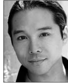
Song Liling