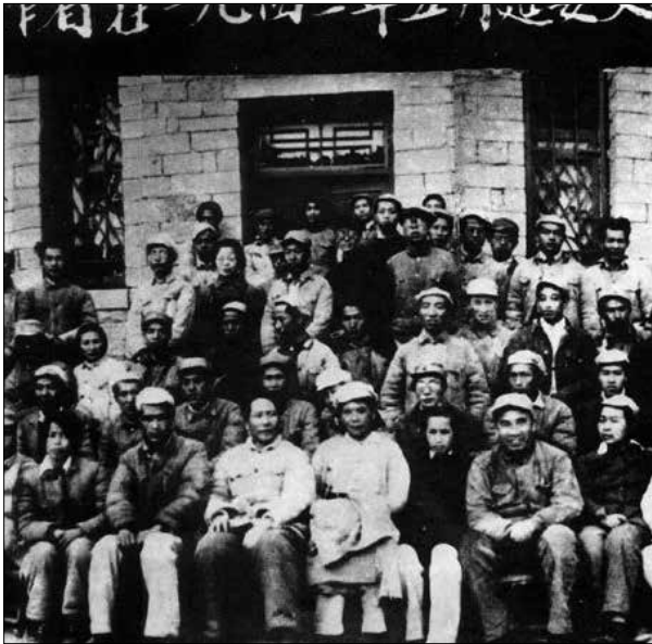
A photograph from the Yan'an Forum on Literature and Art, 1942.