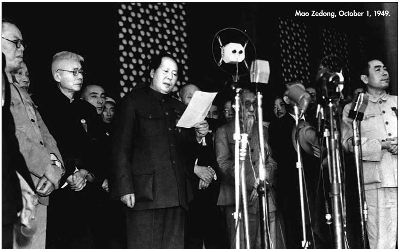
Mao Zedong, October 1, 1949.

Over the next two-and-a-half decades, Mao reshaped China politically, economically and socially through a variety of drastic campaigns. It was a tumultuous period in the country's history—and one that changed its culture forever.