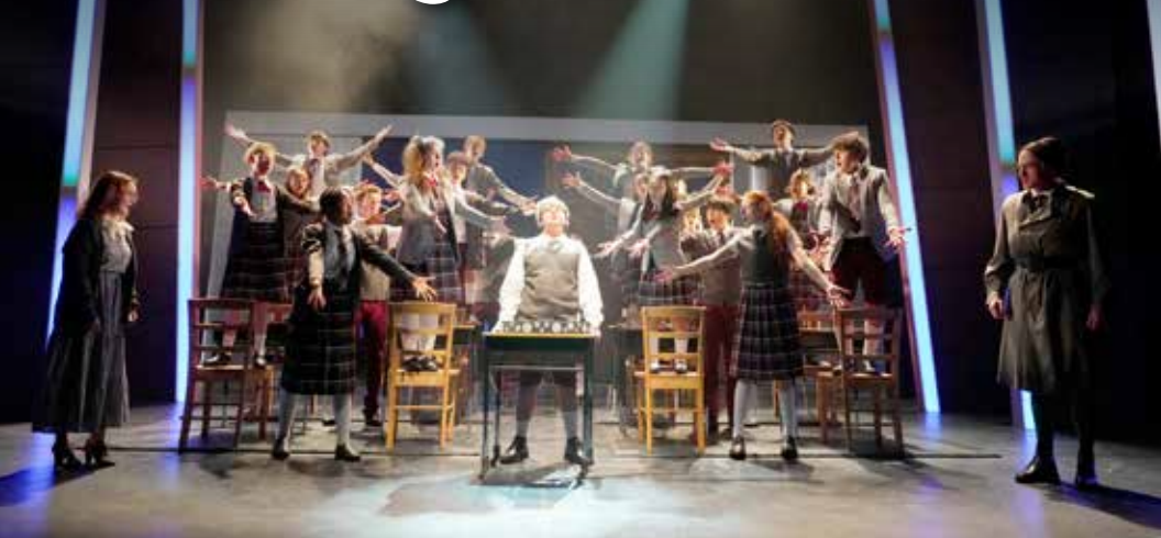
SCR's Summer Players in Matilda The Musical

From students to parents to alumni, everyone has high praise for how acting classes in the SCR Theatre Conservatory provide guidance for success both on the stage and in life. It's no wonder that ParentingOC readers have voted SCR tops for having "The Best" acting classes seven years in a row. Each year, more than 2,000 kids, teens and adults are enrolled (fall, winter, spring and summer) in basic acting skills classes, scene study, musical theatre, improvisation and more. The benefits include better communication skills, self-confidence and self-esteem, and analytic thinking.