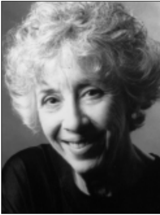
ANN GUILBERT Sadie