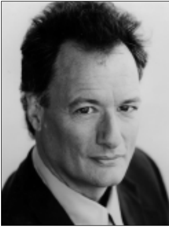
JOHN DE LANCIE Jeffrey