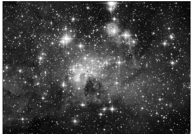
Photo from the Hubble Space Telescope shows a star-forming region in the Large Magellanic Cloud (LMC). This image reveals a large number of low-mass infant stars coexisting with young massive stars.

Known to astronomers since the tenth century, the Large Magellanic Cloud and its neighboring Small Magellanic Cloud are irregular dwarf galaxies visible in the southern hemisphere. They orbit our own Milky Way galaxy, whose gravitational force has contributed to their distorted shape and cloudy appearance.