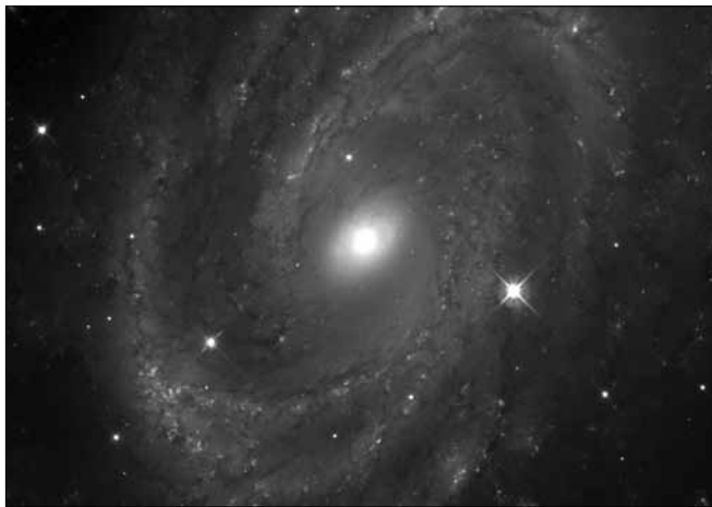
NGC 4603, the most distant galaxy in which pulsating stars called Cepheid variables have been found.

Cepheid Variables are very large, luminous, yellow stars. They change in magnitude (brightness) regularly, with periods of 1 to 70 days between peaks. The stars are called Cepheids after the first star of this type to be discovered, Delta Cephei, a bright star in the constellation of Cepheus.