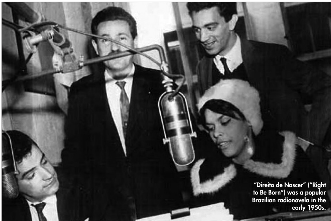
"Direito de Nascer" ("Right to Be Born") was a popular Brazilian radionovela in the early 1950s.

But despite their shared lineage, telenovelas and U.S. soap operas have evolved into distinct genres in