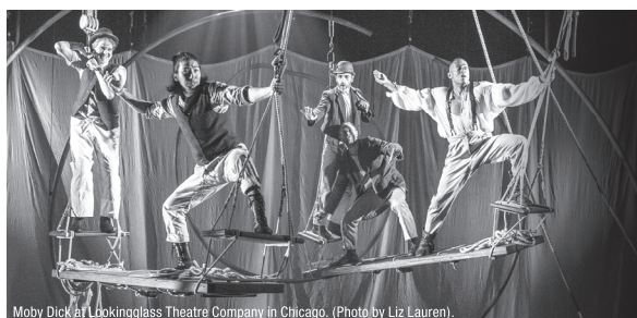
Moby Dick at Lookingglass Theatre Company in Chicago.