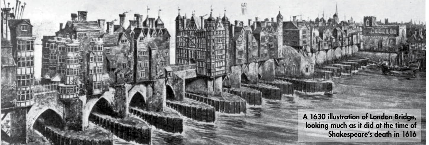
A 1630 illustration of London Bridge, looking much as it did at the time of Shakespeare's death in 1616

A company of players was composed only of men and boys, who played both male and female roles. Scholars theorize that the Lord Chamberlain's Men must have employed two extremely talented boys in the late 1590s, based on the paired female roles of increasing complexity that Shakespeare penned in quick succession: Portia and Calphurnia in Julius Caesar , Rosalind and Celia in As You Like It , followed by Ophelia and Gertrude in Hamlet . The first woman to tread the boards of a professional stage in England appeared in 1660. We do not know the name of the actress, but we know that she played Desdemona in Shakespeare's Othello .