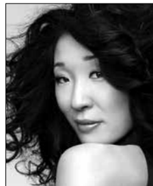
SANDRA OH Gina

Angeles-based, internationally touring clown troupe, Four Clowns. The company’s inaugural show, also titled Four Clowns , toured nationally and took them to notable venues such as La MaMa E.T.C. (New York City), SCR, Sacred Fools Theater Company, The Neo-Futurists (Chicago), Chopin Theatre (Chicago) and Gremlin Theatre (St. Paul, Minn.), among others. His selected television credits include “Scandal,” “Modern Family,” “It’s Always Sunny in Philadelphia,” “How I Met Your Mother” and “Hart of Dixie.” His film credits include Farah Goes Bang (Tribeca Film Festival premiere and recipient of the Nora Ephron Prize) and A Leading Man (Best Supporting Actor, Asians on Film Festival). He also has appeared in numerous national commercials and sends all kinds of love to his mom and wife. theraymondlee.com