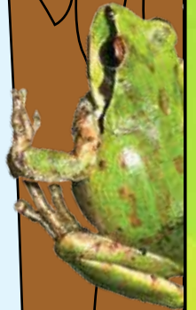
Pacific Treefrog Pseudacris regilla