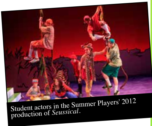
Student actors in the Summer Players' 2012 production of Seussical .

In A Year with Frog and Toad , the actors play a variety of creatures including frogs, toads, snails, lizards, turtles, and moles. All theatre tells a story. If you were cast in one of these roles, how would you help tell the audience the story of your character(s)? That's the heart of the actor's job. As an actor, you're often called upon to use your imagination and pretend to be things like animals—sometimes several different unusual roles within the same play!