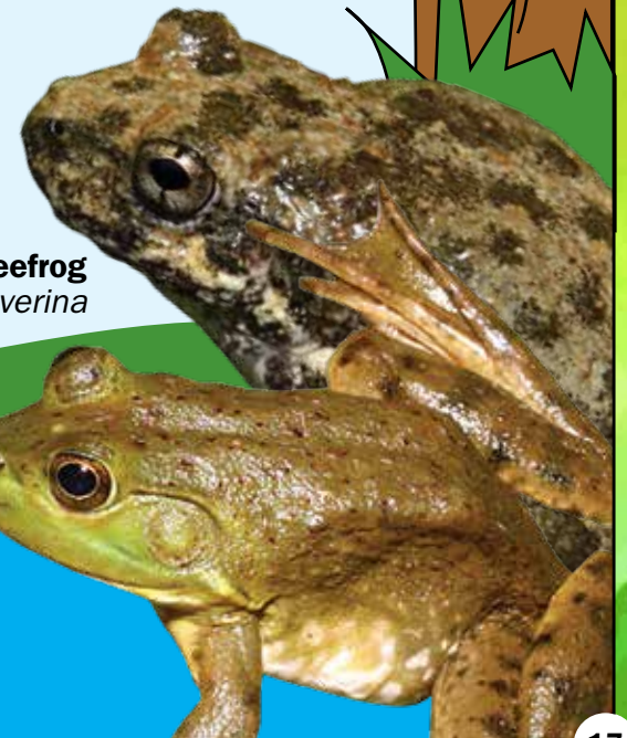
California Treefrog Pseudacris cadaverina