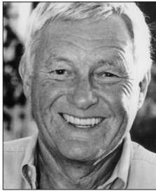
ORSON BEAN* Colonel/Johnny

is making his SCR debut. He was nominated for a Screen Actors Guild award for his performance in the film Being John Malkovich . He starred on Broadway for 20 years, winning a Theater World Award and a Tony Award nomination in the process. He appeared on “The Tonight Show” more than 200 times, 100 of them as substitute host. He played Mrs. McCluskey’s husband in the final three seasons of “Desperate Housewives,” and beat Charlie Sheen with a cane on “Two and a Half Men.” It seems to have done Charlie no good. He is blessed to be married to the actress Alley Mills.